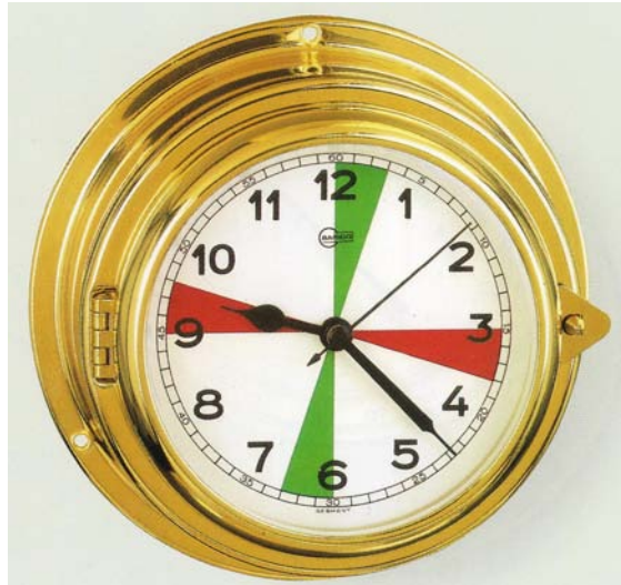
Clock model Yacht 2350 and 2350 fs (radio sectors)

Dial: Ø 100 mm Frame: 150 x 60 mm Weight: 600 gr