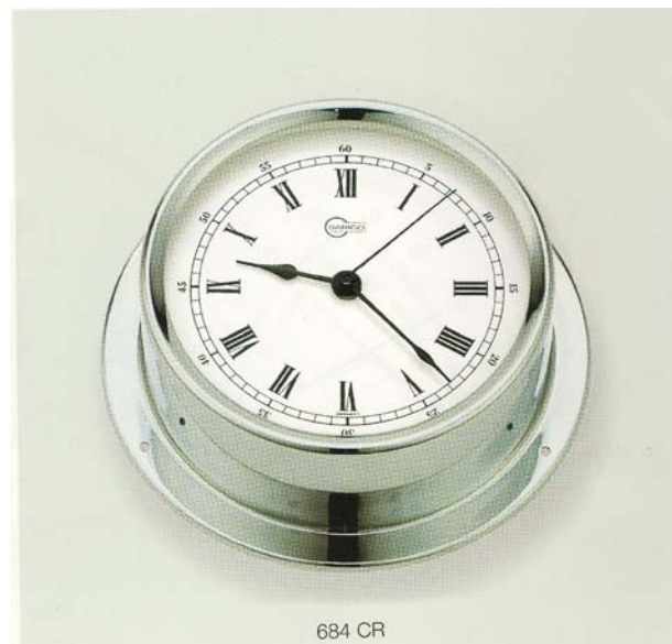
Clock Regatta 684 CR

Dial: Ø 100 mm Frame: 120 x 40 mm Weight: 230 gr