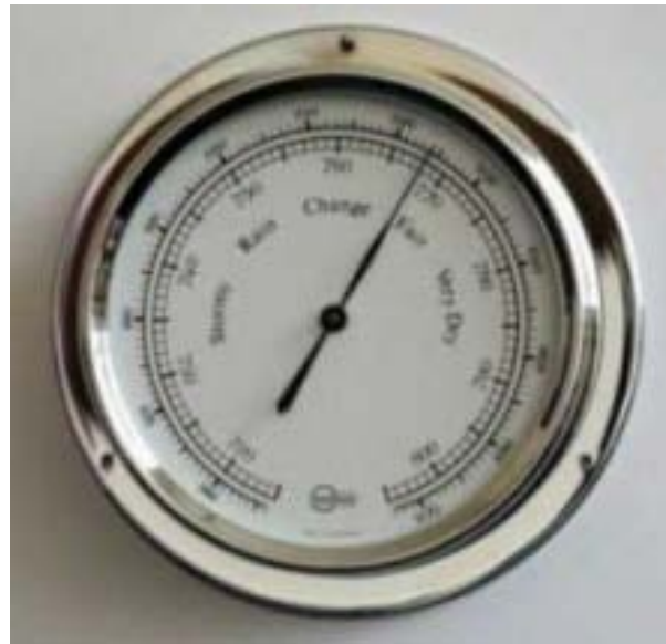
Barometer Regatta 184 CR

Dial: Ø 100 mm Frame: 120 x 40 mm Weight: 230 gr