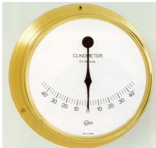
Clinometer model Yacht 911

Dial: Ø 100 mm Frame: 150 x 60 mm Weight: 600 gr