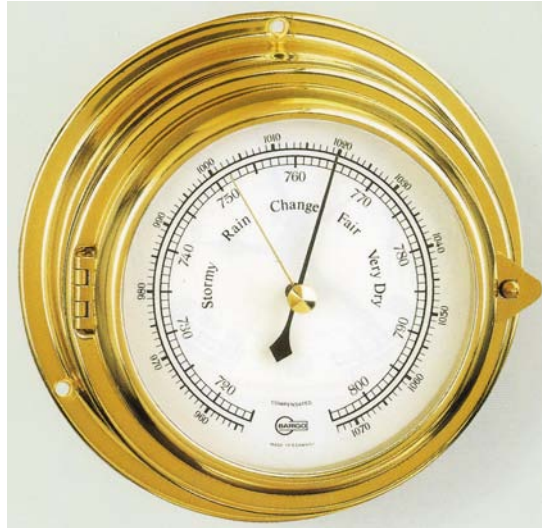
Barometer model Yacht 613

Dial: Ø 100 mm Frame: 150 x 60 mm Weight: 500 gr