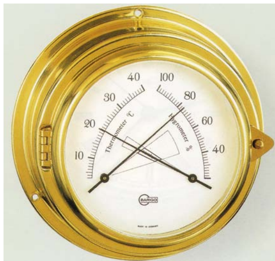
Thermo/hygrometer model Yacht 620

Dial: Ø 100 mm Frame: 150 x 60 mm Weight: 500 gr